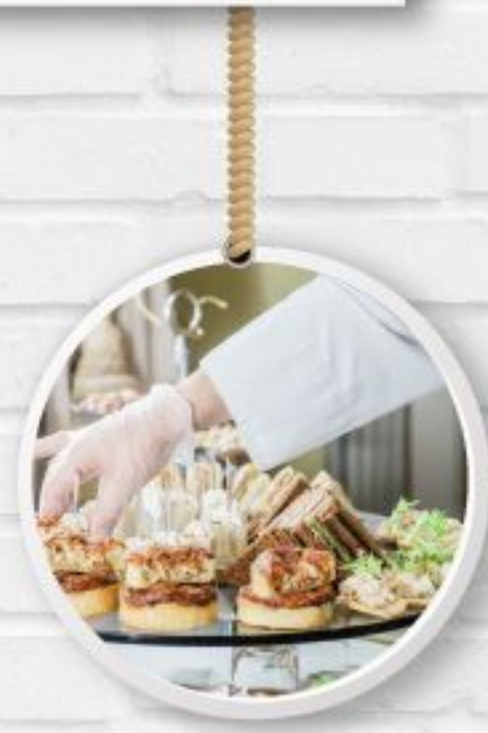
Outside Catering Services